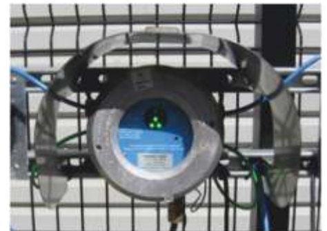
Ground status indicators showing positive grounding of road tanker truck