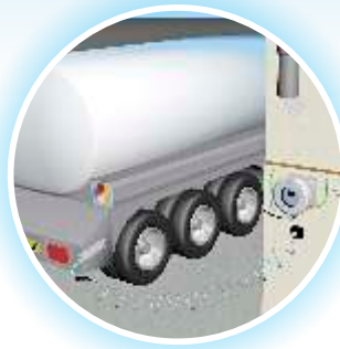
Tank Truck Loading*