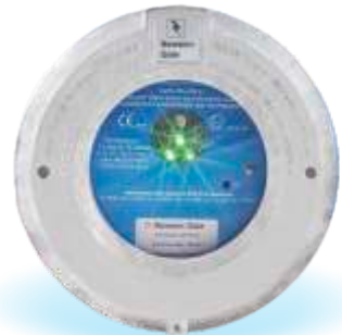
Pulsing LEDs confirm positive ground condition

For more Earth-Rite PLUS grounding applications contact Newson Gale or log on to our website to request a free copy of the Grounding & Bonding Applications Handbook.