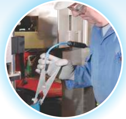
Universal grounding clamp with Quick Connect included