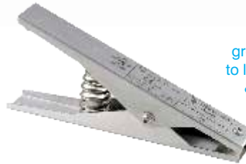
X90 stainless steel static grounding clamp for connection to large containers including IBCs & open top 205 litres drums. (ATEX/FM approved)