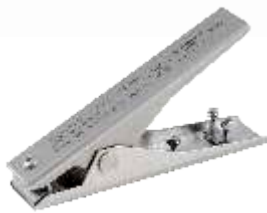
X45 stainless steel static grounding clamp for connection to closed top 205 litres drums and smaller drums & vessels (ATEX/FM approved)