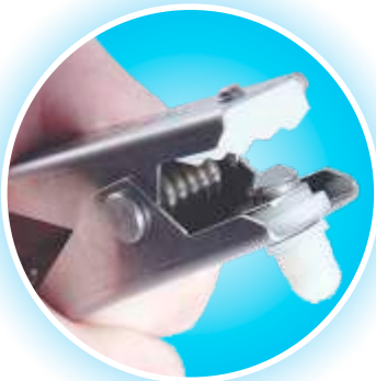
ATEX approved model shown