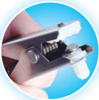
ATEX approved model shown