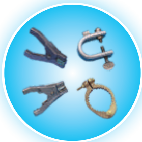
A comprehensive range of clamps and connectors are available for a wide range of applications