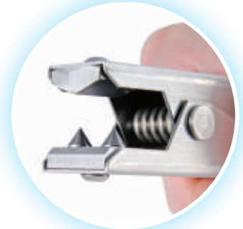
Hardened Tungsten Carbide Tips