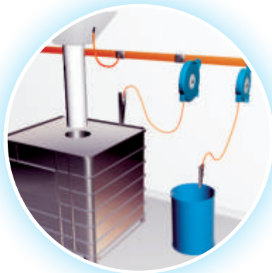
Grounding of metal IBCs and drums with clamps and retractable reels (more detail overleaf)