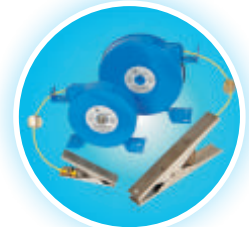
Self retracting reels