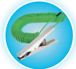
Hytrel® coated cable