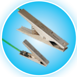
Heavy Duty & Medium Duty Clamps

The all stainless steel and ergonomic construction of the Cen-Stat range of static grounding clamps provide robust and long-life use in the harshest operating environments. The clamps are supplied in two sizes and are specified based on the operating environment and the size of the equipment to be grounded.