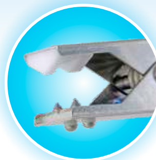
Tungsten Carbide Tips