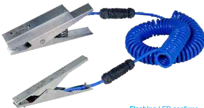
Flashing LED confirms healthy Bond connection