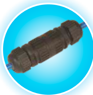
In-Line Quick Connect