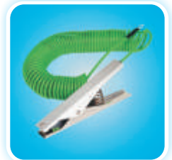
Hytrel® coated cable