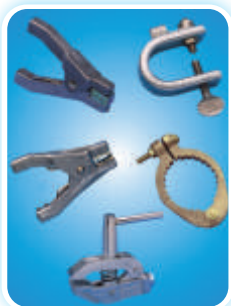
A comprehensive range of clamps and connectors are available for a wide range of applications