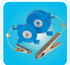
Self retracting reels