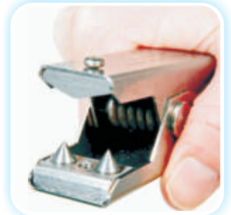
Hardened Tungsten Carbide Tips