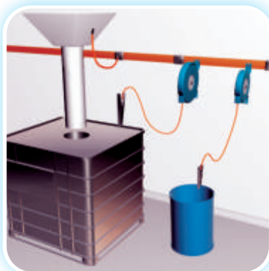
Grounding of metal IBCs and drums with clamps and retractable reels (more detail overleaf)