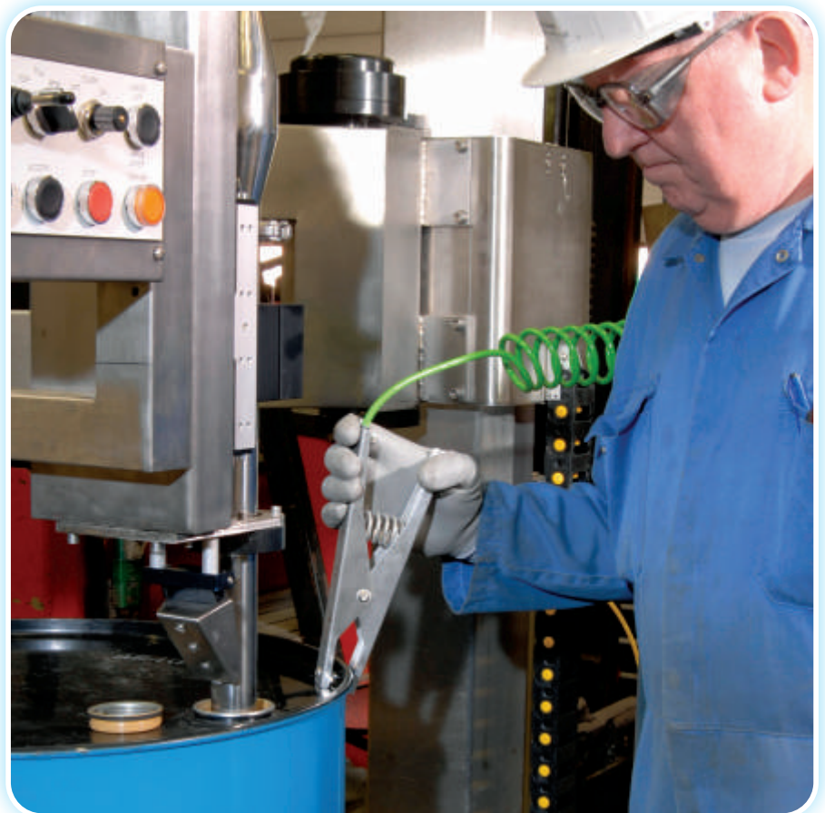
Cen-Stat clamps are designed to penetrate through coatings, hardened product deposits, rust and dirt to enable low resistance electrical connections to safely dissipate static electricity