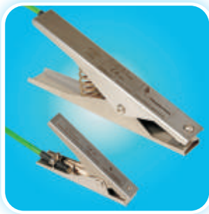
Heavy Duty & Medium Duty Clamps

The all stainless steel and ergonomic construction of the Cen-Stat range of static grounding clamps provide robust and long-life use in the harshest operating environments. The clamps are supplied in two sizes and are specified based on the operating environment and the size of the equipment to be grounded.