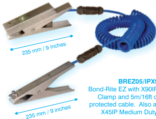
BREZ05/IPX90 Bond-Rite EZ with X90IP Heavy Duty Clamp and 5m/16ft of Hytrel® protected cable. Also available with X45IP Medium Duty Clamp.