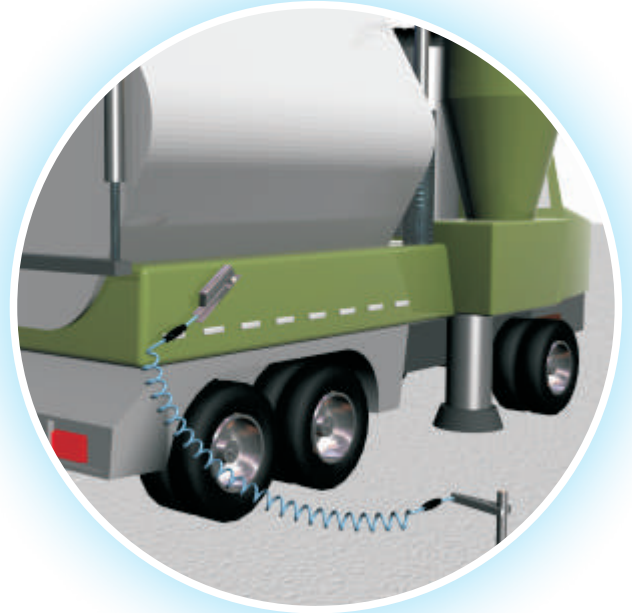
Bonding a Vacuum Truck to Grounding Rod

The Bond-Rite EZ is especially useful in situations requiring temporary or emergency static grounding, where it is not practical to connect to a permanent grounding system, but where safety procedures or guidelines require that bonding and grounding connections must be tested and verified.