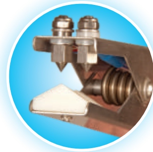
Tungsten Carbide Tips