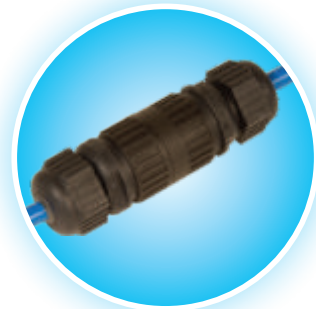
In-Line Quick Connect