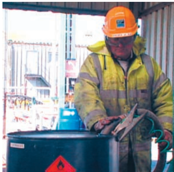
FIGURE 2 | Drum grounding during flammable product transfer.

ings are used, as opposed to anti-static, the latter of which is only capable of preventing a significant charge build up on the lining itself, but which may still render the contents insulated from the outside container.