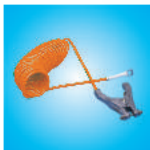
Hard Anodised REB Plier Clamp with 3m Cen-Stat Orange spiral cable VESX41/G09-U