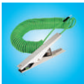
Stainless Steel Heavy Duty Clamp with 5m Cen-Stat Green spiral cable VESX90/G03

The blue cables are generally supplied with a pair of conductors to provide an earthing and monitoring loop, but are also available with a single conductor for monitoring an item that is already earthed.