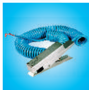
Stainless Steel Dual Circuit Clamp with 10m Cen-Stat Blue spiral cable VESC01/G12